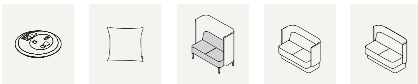
Power and data See price list for details Scatter cushion Two-tone See price list for details Mid back Shallow or deep wing