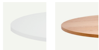
White / black MFMD with matching edgeband Oak veneer with matching edgeband