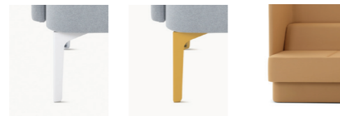
White / black steel legs NaughtOne RAL powder coated legs Upholstered plinth base