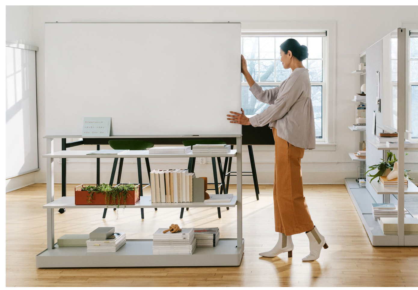
Increase Agility at Every Level

OE1 enables agility at all levels — organisation, team and individual — by creating flexible, fluid environments that adapt to shifting goals and personal preferences.