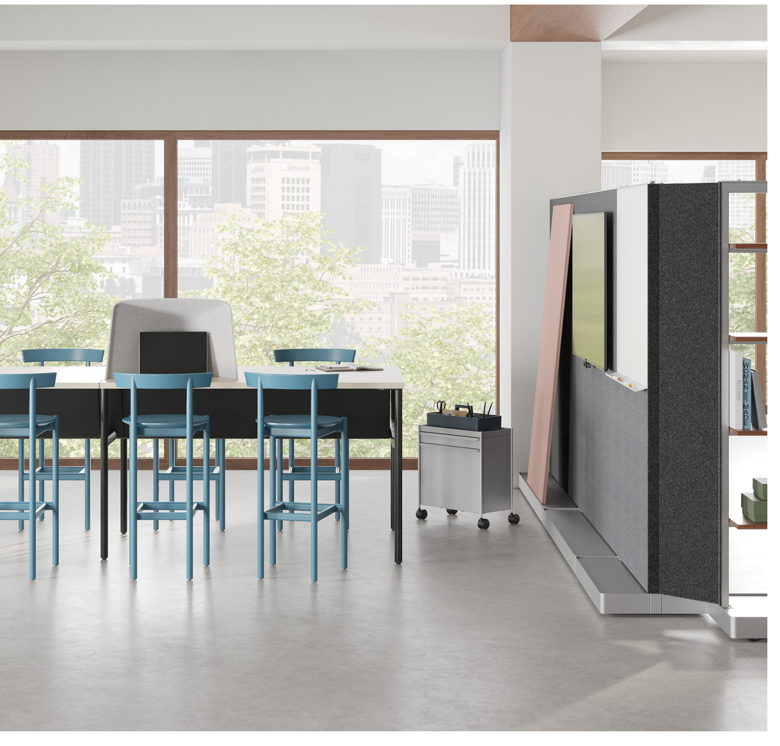
OE1 Communal Table, OE1 Agile Wall, OE1 Personal Hoodie, OE1 Storage Trolley, OE1 Workbox