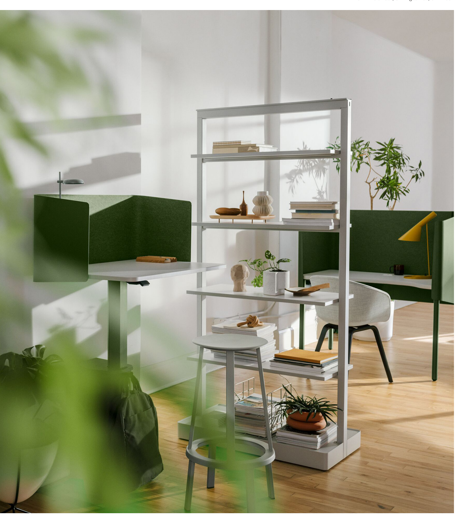
Find the Right Fit

We have options for every work environment – and every aesthetic. OE1's light, minimalist design comes in a wide variety of configurations and colours, helping organisations find their own perfect blend of purpose, performance and expression.