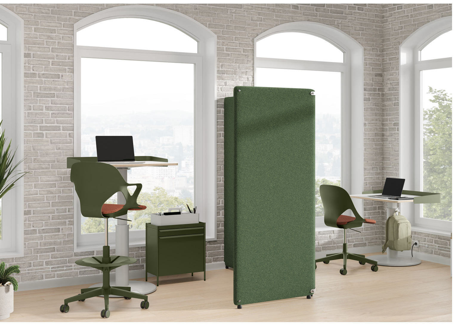
OE1 Sit-Stand Table, OE1 Storage Trolley, OE1 Workbox