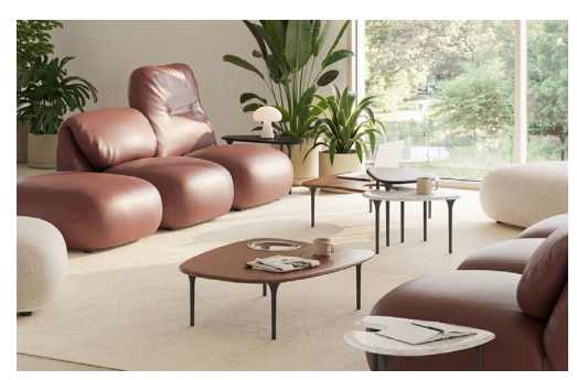
View image library