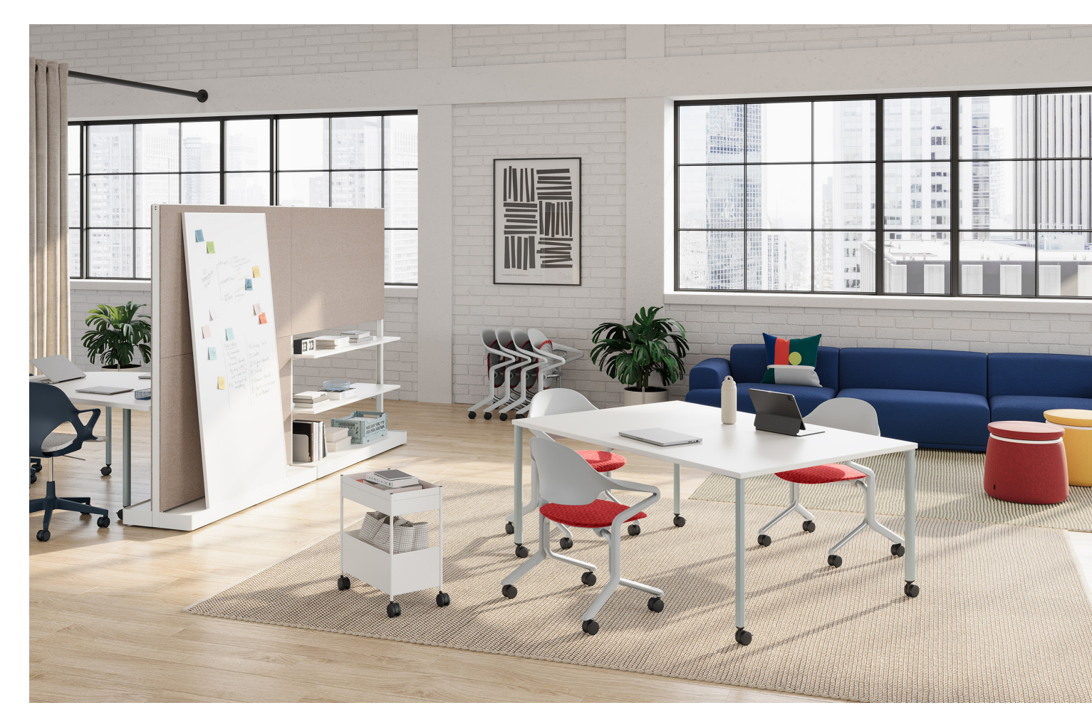
Paired with other agile products like OE1 Workspace Collection, Fuld allows you to easily reconfigure your space to meet the evolving needs of your team.