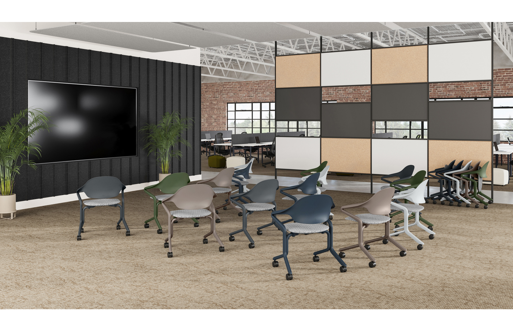
An optional 3D Knit textile, Tuck, is available in a range of colours to add extra flair.