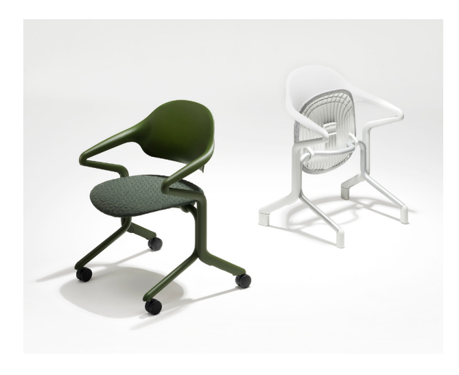
Fuld is available in both glides and castors.

A long-standing commitment to the environment drove Diez's design of Fuld. Its pioneering one-piece construction and tubular arms result in less waste in the production process. The chair comprises just two materials for easy recycling at the end of its lifecycle. In addition, the 3D Knit textile is made from 50 per cent post-consumer recycled content, and because it's knitted to the chair's exact dimensions, there's no fabric waste.