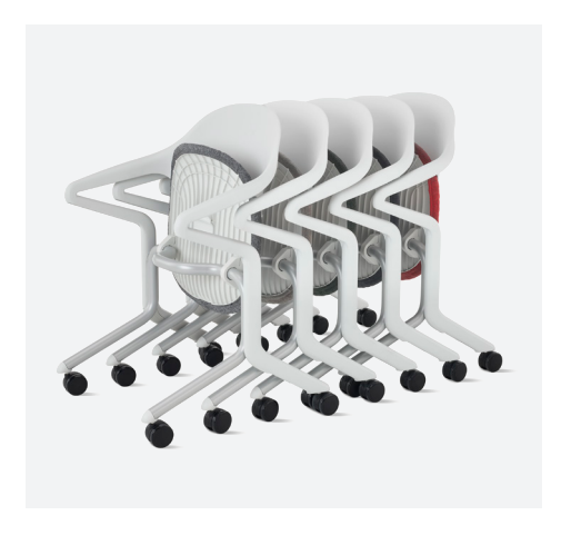
Fuld's seats effortlessly flip up for easy, limitless stacking.

Fuld's contoured seat pocket and a back with a welcome bit of flex provide a surprising degree of comfort. An optional 3D Knit textile, available in a variety of colours, adds visual warmth.