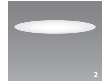
RECESSED CEILING without ceiling trim