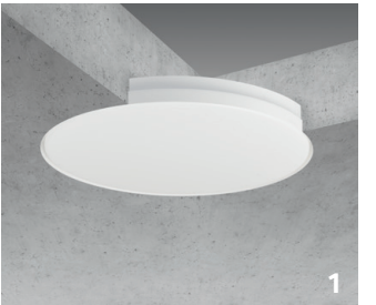
RECESSED CEILING for concrete recessed mounting