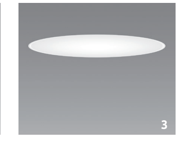
with ceiling trim ø 428, 528, 680, 980 mm