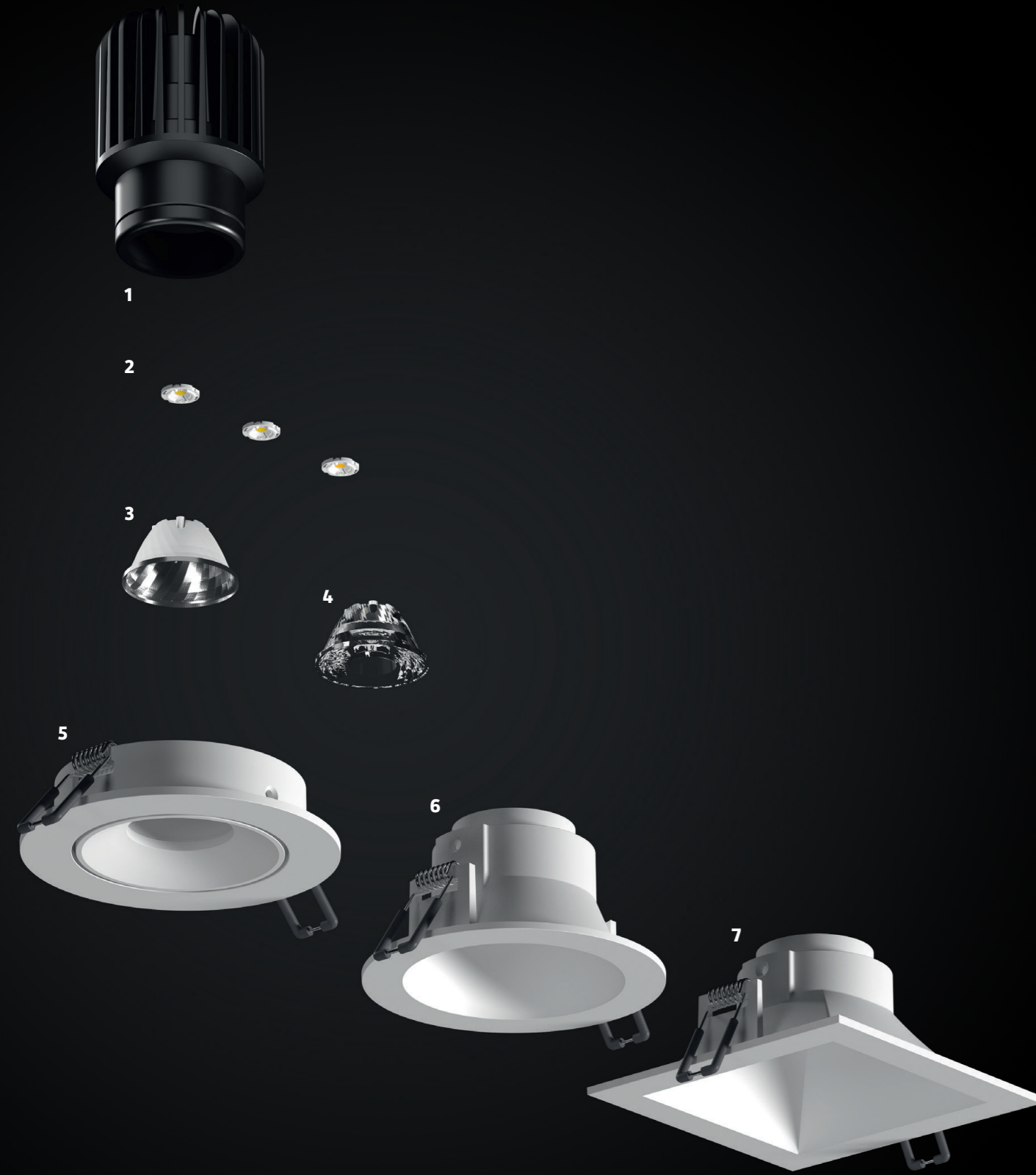
1 HEAT SINK 2 LED CIRCUIT BOARD 4000 K, 3000 K, 2700 K 3 REFLECTOR 4 LENS 5 INNER RING FLUSH-MOUNTED, ROUND 6 INNER RING SET BACK, ROUND 7 INNER RING SET BACK, SQUARE